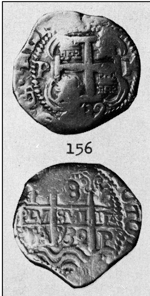
Christensen auction 30 June 1964 lot 156