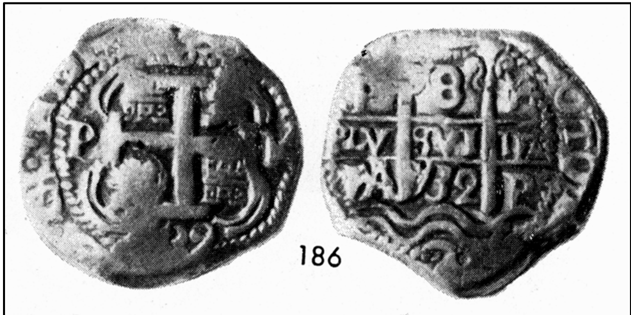
ANE auction 8 & 9 May 1964 lot 186

Dasí, Tomás. Estudio de los reales de a ocho, también llamados pesos, dólares, piastras, patacones o duros españoles Five Volumes. Valencia: 1950. Dasí makes no mention of Potosí 8R 1732 YA. The fact that Dasí makes no mention suggests a strong likelihood that prior references do not mention it either.