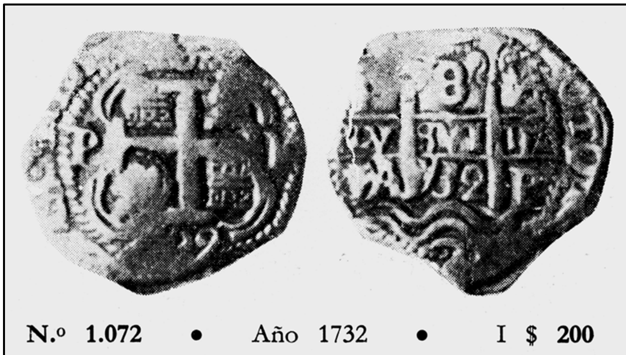
Yriarte, Jose de. Catálogo de los Reales de a Ocho Españoles , Madrid, 1965 (p. 175, no. 1.072).